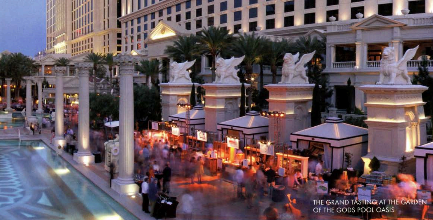
THE GRAND TASTING AT THE GARDEN OF THE GODS POOL OASIS